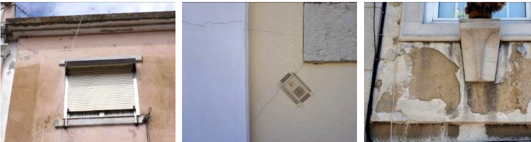
Different types of defects observed on rendered façades during visual inspections: stains, cracks and loss of cohesion and adhesion (from left to right).

Climate change, rendered façades, climate agents, degradation evolution, future degradation and service life.