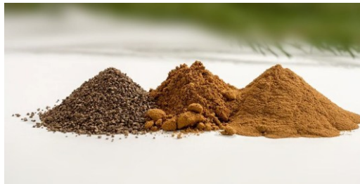
Figure 1. Appearance of different types of lignin.

The project is a joint initiative of Submerci, Lda (a material production and construction company) and three entities of the scientific and technological system (IPC-ISEC, IST and CTCV), which possess technological and scientific competencies for the realisation of all the project's planned tasks.