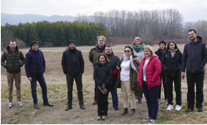
Figure 3. Field trip at Pirot region, Serbia.