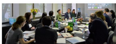
Figure 2. RESONATE learning platform ( Resonate Water Management Platform ).