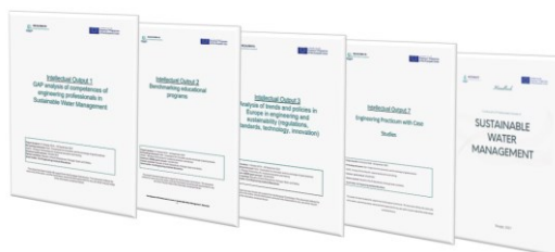
Figure 1. Intellectual outputs (O1, O2, O3, O4 and O7).