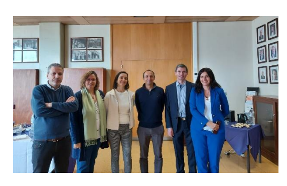
Figure 1. Team members from CERIS and CUT during a joint meeting in IST, Lisbon.

Therefore, this project shall provide results within the fields of scientific research and knowledge exchange. The project has been developing scientific research and knowledge exchange, carried out within the framework of an international academic partnership (Figure 1). These actions include, joint research between leader and partners and organization of workshops, lectures and study visits. The results shall provide a foundation for the development of a lasting cooperation of entities forming the partnership.