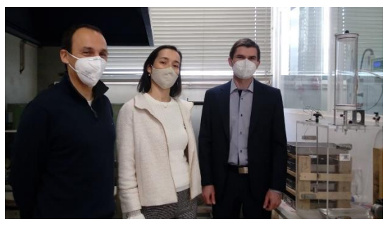
Figure 3. Team members from CERIS and CUT during a study visit to Construction Materials Lab, DECivil. Acrylic carbonation chamber on the right.

The knowledge exchange will allow cooperation between the partners whose research topic covers the fabrication of materials/goods, for which production the substrate is necessary, which in turn is a product provided by another partner. This approach will allow to assess the integration of the production of goods through the use of wastes, such as CO2 and waste biomass. The results of the project will also allow for defining the scope of further possibilities of mutual cooperation.