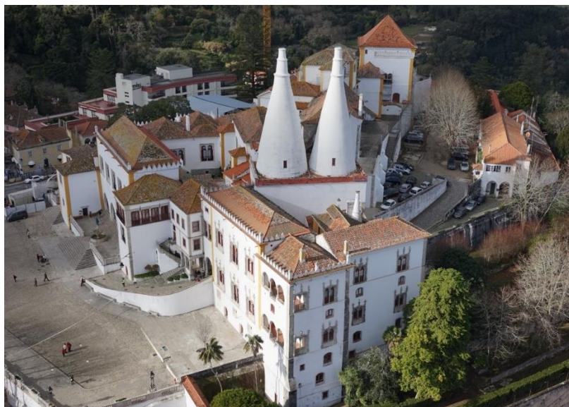
Figure 1. Aerial view of National Palace of Sintra.