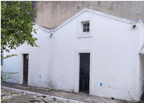
Building envelope inspection.

Building envelope, condition-based maintenance, maintenance strategies, durability of constructions, service life prediction, maintenance impact.