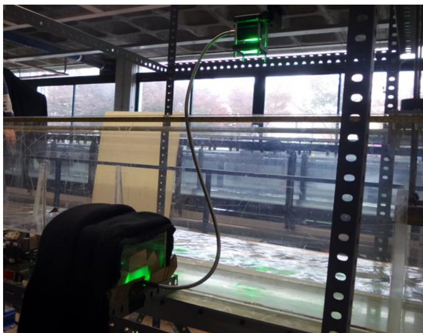
Figure 2. Prototype installed on a laboratory channel.