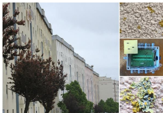
Figure 1. Evaluation of the hygrothermal conditions and of the biological colonization observed on External Thermal Insulation Composite Systems (ETICS).

The project intended, ultimately, to further explore the biological habitat of ETICS façades and to minimize the development of biological colonization on these constructive systems.