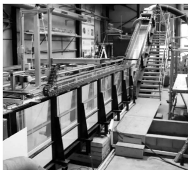
Photo of the physical model with the inclined chute in the background and the stilling basin at the front.

Stepped spillway, hydraulic jump, stilling basin, flow depths, fluctuating bottom pressures, air-water flow properties, jump length, roller length, stilling basin length.