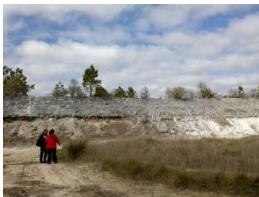
Figure 3. Industrial landfill with potential hazardous wastes (over 320 000 m 3 ) for surface and groundwater bodies.

organic contaminants) but the population historically relies on groundwater as a source of water supply for domestic and agricultural uses.