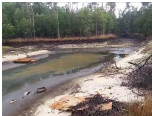
Figure 4. The Veiros lagoon, a groundwater-dependent ecosystem (GWDE) that reflects the poor chemical quality of the groundwater in the Aveiro Quaternary groundwater body.

The ECC has a long history of soil, surface and groundwater contamination related to the past practices which often included accumulation of residues at open pits and discharge of non-treated waters that caused serious environmental impacts.