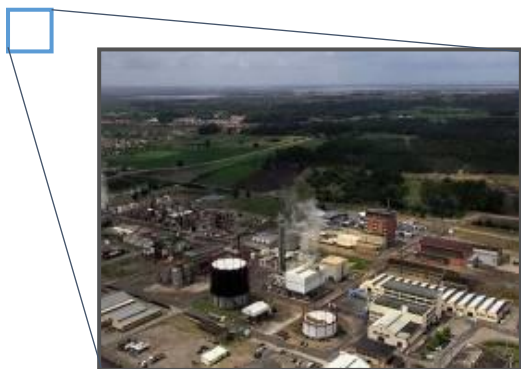
Figure 2. Location of the Estarreja Chemical Complex.

Estarreja Chemical Complex Area (NW, Portugal).