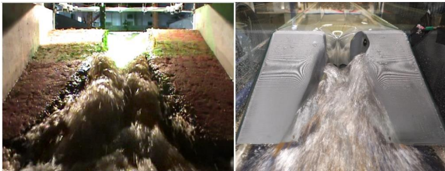
Figure 1. Breaching of overtopped dams. Left: physical model; right: fixed bed model to investigate hydrodynamic processes.

The project is based on five tasks: Task 1, which consists of developing a conceptual model for the calculation of discharge in landfills following overtopping, covering both geotechnical and hydrodynamic phenomena of failure; Tasks 2 and 3, which are based on a laboratory basis, in which data are collected for the empirical characterization of hydraulic and geotechnical phenomena (Figure 1), that is, of the velocity fields close to the breach and the effluent flows from the rupture, as well as the erosion/deposition processes soil, with the respective characterization of all geotechnical instability phenomena (detachment of soil masses from the dam body for the flow, due to slope instability); and Task 4, of a computational nature, in which the numerical model of fluid-sediment mixtures is developed (Figure 2). Task 5 aims to disseminate and transfer know-how acquired during the Project, having organized 2 workshops and 1 seminar.