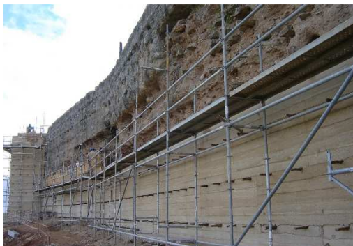
New rammed earth in heritage conservation site.