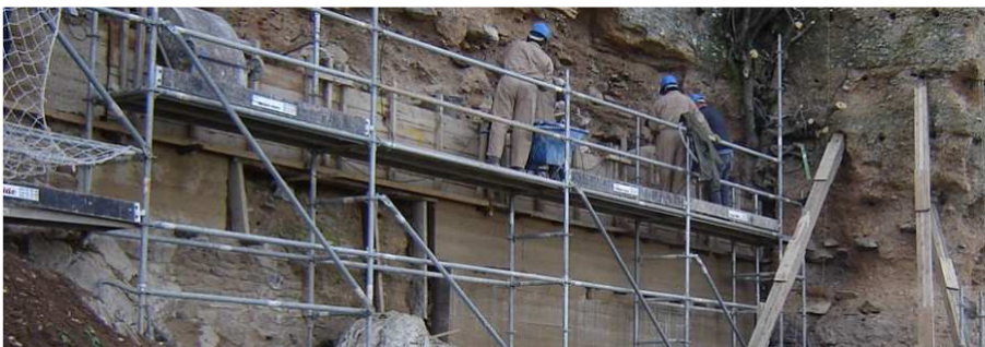
Heritage rammed earth repair and conservation.

Earthen construction, rammed earth, conservation, quality control, sustainability, regulations.