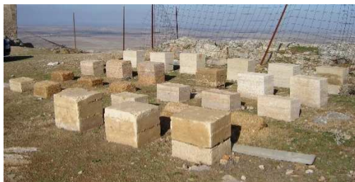
Rammed earth on site sampling.