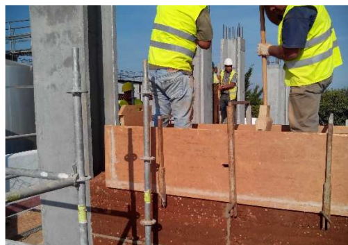
New rammed earth in a new construction site.