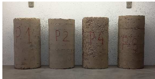
Rammed earth samples for laboratory analysis.