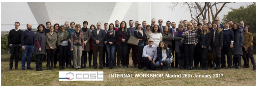
Figure 2. SARCOS members present in the Madrid 2017 meeting.