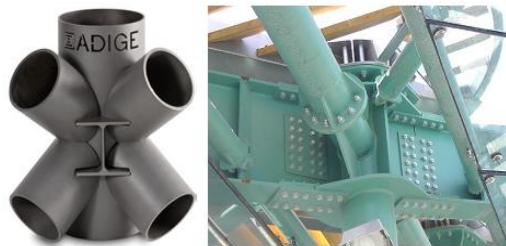
Figure 3. Traditional joint and LASTEICON solution.

LASTEICON proposes using LCT in the fabrication of I-beam-to-CHS-column joints. This can drastically reduce fabrication costs, as well as meeting the structural requirements, expanding also the freedom of architects and engineers when developing new projects. Figure 3 shows a prototype of laser-cut joint compared with a typical diaphragm joint.