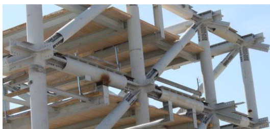
Figure 2. Example hollow section joints with stiffeners and welding.

Circular hollow sections (CHS) have excellent properties with high compression, tension and bending resistance in all directions, thanks to their inherent shape and geometrical properties. Structures produced using tubular sections have lighter overall weights in the order of 40%, and they require smaller volume of fire protection material than their equivalent H section. Indeed, CHS columns can be designed to have a fire resistance up to 120 minutes, without using fire protection. Moreover, tubular profiles also have reduced transport costs. They are also architecturally very appealing offering more space, and freedom to the designers (Figure 2).