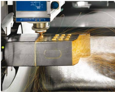
Figure 1. An example to the automated laser cutting process.

Modern laser tube cutting machines are capable of making any type of cut on steel tubes, in entirely automatic, programmed cycles. CAD programming and the laser beam eliminate the traditional fixed costs determined by punches, clamps, tools, templates and dies, Figure 1. The laser cutting technology (LCT) has so far generated significant benefits in both processing and cost terms, for a wide range of applications. ADIGESYS reports that their customers obtained production improvements in the range from 70 to 80% through LCT, with respect to conventional processes. This was mainly thanks to more stringent machining tolerances resulting in improved quality of joints, fittings, easier fastenings, process efficiency and vast flexibility.