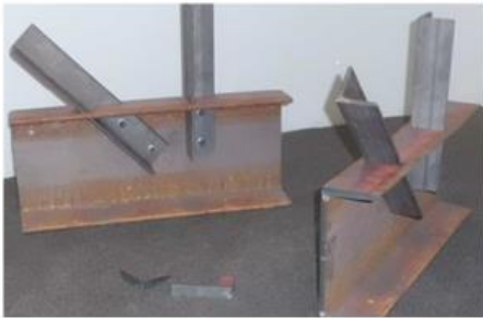
Figure 4. Prototype of truss girder specimens obtained by LCT.

Specifically, LASTEICON proposes the following benefits to what has already been achieved to date: