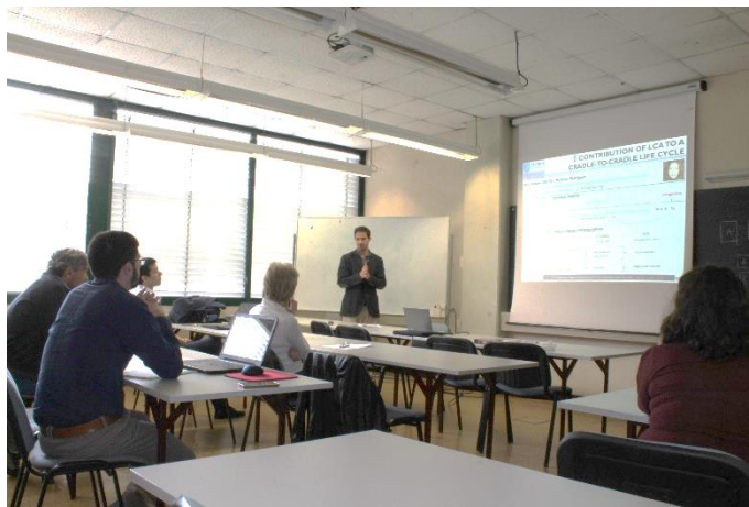
Figure 1. Knowledge exchange session.

These travels served not only for knowledge exchange and for the organization of dissemination events: a project proposal was prepared and joint publications were published in conferences and in a leading journal on the topic (Structural Concrete).