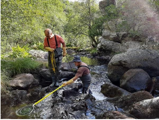
Figure 1. Fish habitat use assessment downstream Covas do Barroso HPP.