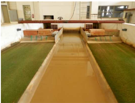
Upstream view of the compound-channel facility.

Open-channel flow, compound channel, shear layer, cylinder, drag, mean flow, turbulence, experimental tests, acoustic doppler velocimeter, hydrodynamics.