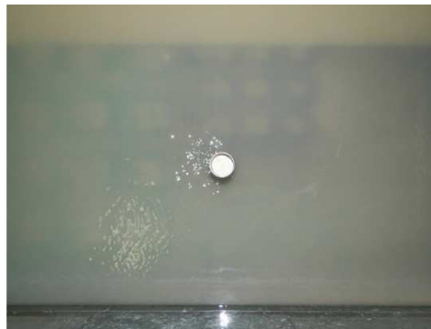
Probationary test with emergent circular cylinder.